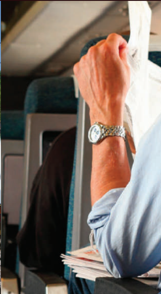
TRINITY RAILWAY EXPRESS